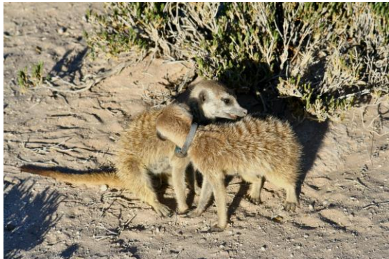
Brea (VLM157) and Swift (VWF176) grooming each other, having a couple moment before leaving their burrow to go foraging.

Brea turned out to be long lived and very successful dominant males. We cannot wait to see what these two are going to be up to in the near future! Long live Brea!