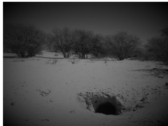
The Cursed Burrow.

when volunteers started to jokingly call the babysitting burrow the Cursed Burrow.