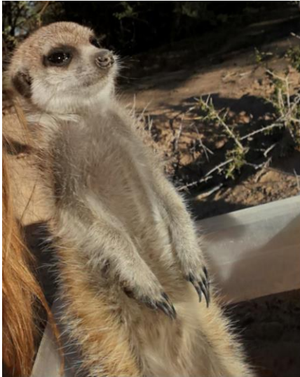
Slop (VLM253) the prodigal son who returned and was accepted back into the group after being missing for 14 days!