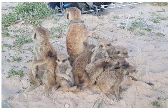
The six Lazuli pups some of who succumbed to the Cursed Burrow with Nelson (VLM248) on the left, and with the dominant male Polon (VJXM095) in the middle with the collar.

It was possible that they were roving, Sizzle (VLM252) would have been a little young, as he was only 5 months old. However, with meerkats they like to show us that anything is possible! Yet, a month passed and both Nelson (VLM248) and Sizzle (VLM252) were given their last seen. Volunteers were disappointed because both boys had been extremely lovely meerkats.