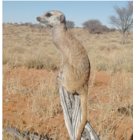
Brea (VLM157) guarding, making sure his family stays safe.

Brea (VLM157) grew up at Lazuli, and just before turning 2, he went on his very first roving exploration in July 2011 at Jaxx. He was gone for about 3 months and had been seen approaching Jaxx seven times. From this day on, young Brea (VLM157) was always on the move, he would leave his home group, go visit neighboring groups and come back, but just a few days at a time.