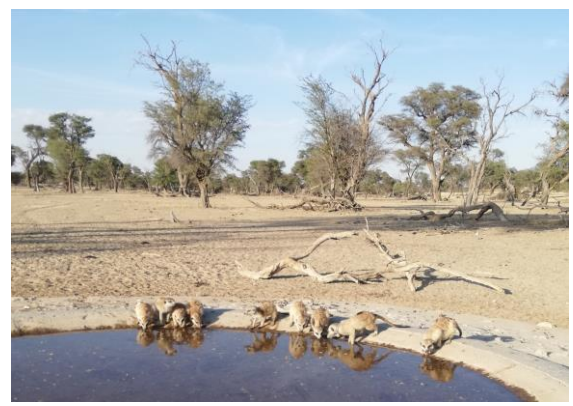
A depleted Make-e-plan pausing for a drink. The group only contains from R-L; Bridgit (VQLF011), Banksia (VVHM117), Bigwig (VMPF022), the 6 sub adults born in March, and Tom (VMPM031) who is out of the frame

Lennon (VLF246) and Sausage (VLF250) all left the group on one occasion this month. No eviction was witnessed; however, the older females have been previously evicted, and this season have received aggressions from the dominant female Sigma (VLF230).