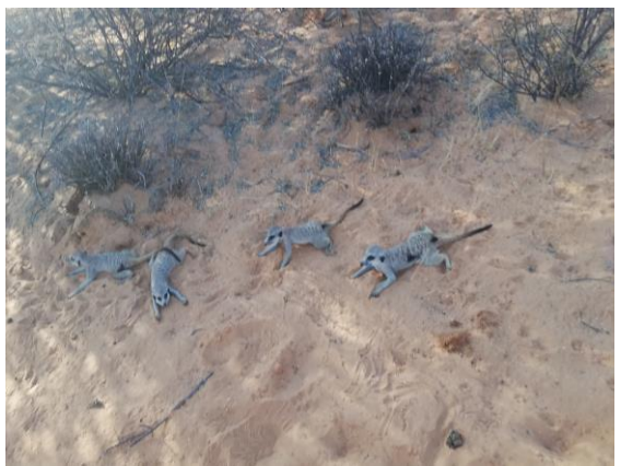
Sauce (VZUM026), Aragon (VECM009), Legolas (VECM010) and Gimli (VECM011) (R-L) taking a break after Sauce immigrated in and became the new dominant male of Elrond's Council.

In the days after Gandalf's disappearance the group was not visited for a couple of days. On the 4th of October, however, a meerkat volunteer was waiting at the sleeping burrow for the group to get up, when who woke up with the group? One of our most notorious rovers... Sauce (VZUM026)!! He was being submitted to by the older Elrond's males Merry (VECM002), Aragon (VECM011), Samwise and Frodo (the two undyed wild yearling males). Sauce was also acting very dominant, marking everything and everyone in sight!