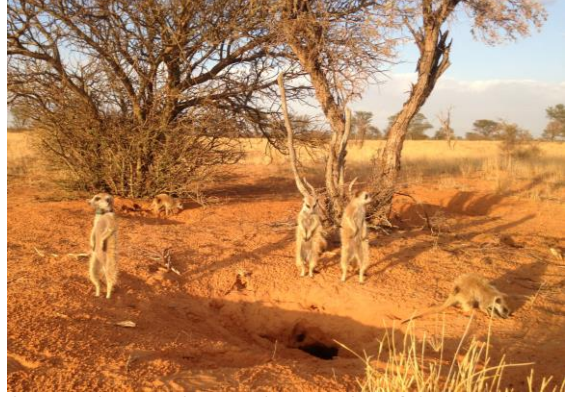
Spruddel (VZUF028), Timon (VZUF048), Lil'G (VZUF029), Lenti (VZUF032) and Pumba (VZUF048) enjoying an early morning as an all-female group of five.

However, there were multiple males interested in joining the new all-female Zulus! Just one day after the last of the four males had left, on the 11<sup>th</sup> of October, Shrew (VUBM018) was roving and immigrated into the group. Spruddel exerted her dominance over him, but eventually allowed him into the group! Shrew's stay at Zulus was short lived as, four days later, on the 15<sup>th</sup>, a wild male was seen around Zulus. Once this male was accepted into the group, Shrew left and returned to Ubuntu.