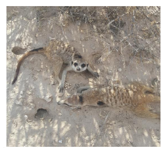
Smeagol (VECM006) and Umfana (VZUM034) resting together after the second wave of Zulus invaders. As you can see, Smeagol is unbothered by his new group mate.

There is one way in which all members of Elrond's Council have been affected by the newcomers. With the influx of fully habituated meerkats Elrond's Council's habituation levels have substantially increased! Volunteers are now able to follow the group for longer and at closer distances. Hopefully this trend will continue, and Elrond's Council will become a fully habituated group in the near future! Only time will tell if the Zulus invaders will settle and if Elrond's Council will improve into a fully habituated group!