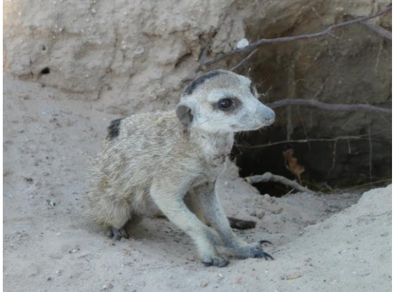
Pet looking worse for wear after multiple weeks away from his group.