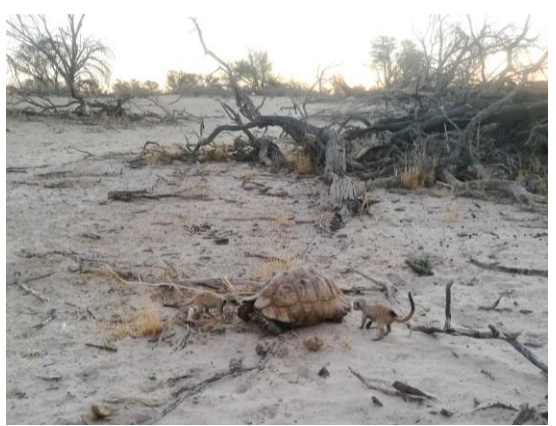
Two of the latest Jaxx pups investigating a tortoise while foraging with the group.

This month there was a baby boom at the KMP. As you know, Baloo (VJXF080) gave birth last month. She had four pups that emerged on the 7th of November and started foraging with the group on the 13th. Swift (VWF176) gave birth to her twenty-first litter only 81 days after giving birth to her previous litter! So far there have been two pups seen that emerged from the babysitting burrow, however they have yet to forage with the group. Heatherleigh (VQLF018) has given birth to Namagua's third litter, one pup was seen below in the burrow mouth with its eves still closed, and more pups were heard below! Bridgit (VQLF011), Heatherleigh's sister, has given birth to her eleventh litter. No pups have been seen yet. Bridget is lactating, and babysitters have been left every day!