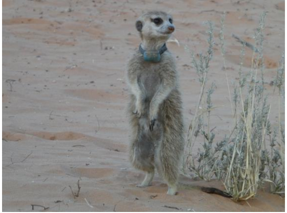
Pet (VCVM001) displaying vigilance behaviours during a session with Hakuna Matata. You can see his right paw has been declawed.

Pet (VCVM001), one of the founding members of Hakuna Matata, was first seen, as a juvenile, on the 21<sup>st</sup> of December 2011. He was seen initially with another iconic meerkat Brea (VLM157) and his brother Rufio (VLM155), while they were roving away from their group, Cavemen. When they returned to the group, Pet immigrated into Cavemen. This group consisted of four individuals: Dinkop (VJXF008), the dominant female, Franzs (VLM149), Brea, and Rufio. Pet was the first new addition to this group. When first seen by the meerkat volunteers in 2011 he was already very well habituated, he was used to being around people, despite having never been seen in the population before. He also had been declawed on his right paw. Declawing is, unfortunately, a common occurrence with pet meerkats. This combined with his lack of fear from humans lead volunteers of the time to deduce that he had probably been a pet meerkat previously, hence the name Pet.