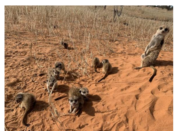
Boromir (VECM016) babysitting all nine fully emerged pups at Elrond's Council.

The majority of meerkat pups are born in the peak breeding season (September to March), and yet across the past two months we have had at least seven females give birth to litters where pups have survived to emergence or where groups were still showing babysitting and lactation activity by the end of the month. These births have occurred in six out of twelve of the study groups including Elrond's Council, Make-E-Plan, Namaqua, Ubuntu, Jaxx and Lazuli. Female meerkats are able to reproduce up to four times per year, with dominant females usually attempting to breed 2-3 times annually and subordinate females rarely attempting to breed more than once a year.