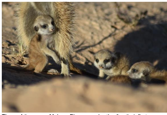
Three of the young Make-e-Plan pups shortly after their first emerge during May.

Meanwhile at Jaxx and Lazuli we are awaiting to see if pups will emerge. There has been consistent babysitting at both groups, with dominant female Baloo (VJXF080) and subordinate female Nävis (VJXF128) lactating at Jaxx. At Lazuli dominant female Sigma (VLF230) and subordinate female Annie (VLF240), who gave birth within two days of each other, have both been lactating. It will be interesting to see how the Winter Babies fare in the months to come.