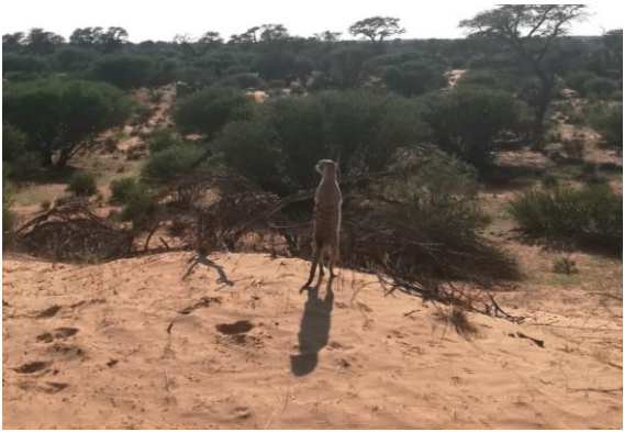
Sauce (VZUM026) guarding Elrond's Council territory.

Studies looking into the roving activities of males often find that most activity is experienced between June and December which reflects higher female fertility levels and more instances of evicted females. They also report that subordinate males that reside with their natal group are more likely to have greater roving activity than immigrant males of a similar age, due to the availability of unrelated breeding partners.