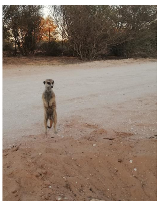
Sauce (VZUM026) seen roving at Namaqua.

Council was very brief, and he had returned to Zulus just the following day. For the following 6 months, Sauce continued to regularly leave Zulus for short time periods, with no clear indication of where he was going as he was not seen interacting with any other groups. There was just a single occurrence following an inter-group interaction between Zulus and Elrond's Council where Sauce left following this, and so it was assumed that it may have once more been Elrond's Council that was his destination.