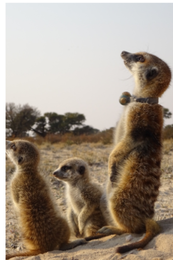
Whiskey babysitting Edna May's litter

Moofles (VPAF019) - It was only a matter of time that dominant female Shoshonna (VPAF009) evicted Moofles from Pandora, since both females had very round bellies. A few days after her eviction, Moofles gave birth. Then, long-term Rascals evictee Mouth (VRRF156) showed up at Moofles' babysitting burrow. Mouth made