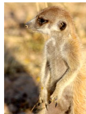
Spock, 2.5 months old

Meet Spock – the two-fingered pup! Spock (VUKM025) was born on July 23 rd , with just two fingers to each of his front paws. He manages to find food same as his siblings, and is doing well – and yes, there's a meerkat named Spock now, finally. Live long and prosper!