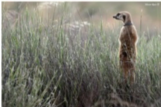
Crusty on guard

"Crusty was the best male ever! Always on guard, always feeding the pups... I remember one day that he was guarding on top of a tree for 1 hour and 20 minutes. Oh and his anal marks smelled really bad, even worse than the ones of other dominant males. What a meerkat! What a legend!"