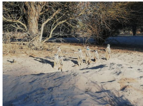
Endorphine (VTSF005) with her new collar (third from the right), meaning volunteers can now track Tswana again.