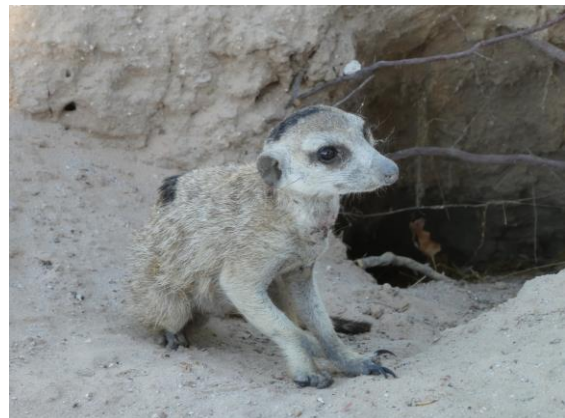
Pet looking worse for wear after multiple weeks away from his group.