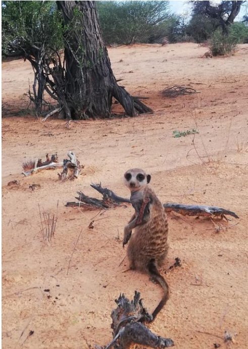
Smeagol (VECM06) left forearm wound has healed significantly.

The wound that initially covered the entirety of Smeagol's left shoulder and continued down his forearm to his left wrist, healed into a thin wound from his shoulder to his elbow, with approximately 25% of its original size. He continues to limp but not nearly as badly. He has begun to act like his usual self again having foraging competitions with his younger brothers constantly.