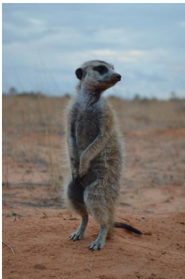
Pixie (VWM210) being vigilant within the group following the dominance change, his neck scar clear.

We continue to observe Zulus with this new dominance change as to how long it will remain and how the group may change further. Spruddel appears to have lost the litter from her pregnancy we reported on last month, but Lil G (VZUF029) and Lentil (VZUF032) are currently pregnant.