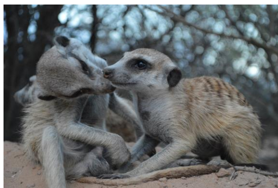
From left to right: subordinate male Bonnie (VWM209) with a submandibular TB lump, grooming young Melee (VNQM007) in January 2020.

There were 12 individuals present at the end of September. Both Tussle and Melee disappeared on different days and have remained absent. Both males were emaciated and lethargic when they were last seen. Ambush, who was absent from the group at the end of last month, has not returned since. Observers assume he did not survive. The remaining male from the yearling litter, Quarrel