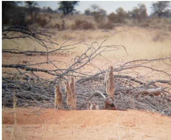
Alert Phoenix individuals, radio-collared sub-adult Pinky (VPHF001) can be seen on the right.

to forage very gradually. The adults are more cautious and take longer to depart. Observers have been scattering small amounts of boiled egg around their burrow to see if any individuals will take to it. So far the meerkats have paid little attention to the offerings (on the other hand, the local birds and a Cape ground squirrel seem to love boiled egg...)