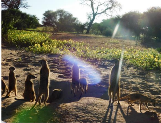
From better days: Namaqua sunning at a burrow surrounded by flowers.

Heatherleigh and Lewie chased and attacked the rovers, resulting in chaos. Over the following days the pups, Chateaubriand and Megatron II were all last seen. The Whiskers boys immigrated into the group and Lewie lost his position as dominant male. Dominance competitions between the males persisted for weeks. Heatherleigh was reported to regularly assert herself over the immigrated individuals, sometimes quite aggressively. The general unrest among the members grew into intense conflict, resulting in injuries such as limpings, swellings and severe facial wounds. Eventually, Lewie reclaimed dominance. Genetic testing confirmed that he sired Heatherleigh's next litter: Ambush, Tussle, Melee, Skirmish and Quarrel. For a time everything settled. But during Heatherleigh's next pregnancy the position of dominant male was challenged again when Bonnie and Clyde returned from roving and competed with Lewie. Within days Lewie reclaimed dominance once more. Clyde suffered major wounds from the fighting and disappeared. He has not been seen since.