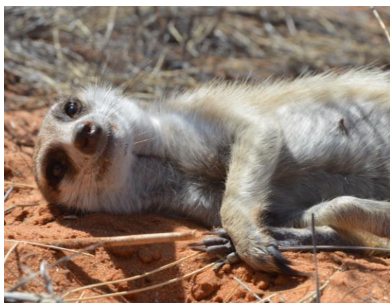
Dominant female Heatherleigh (VQLF018) at the beginning of the month when her submandibular lump was starting to become noticeable.

It is with sadness that I must report that the tuberculosis has resurfaced at Namaqua. The last individual with signs of infection was the subordinate male Bonnie (VWM209) who was last seen in January. For months no other individuals displayed any symptoms. Suspicions first arose in July when yearling subordinate males Ambush (VNQM006) and Tussle (VNQM008) showed significant weight loss for seemingly no discernable reason. A month later their littermate Melee (VNQM007) also deteriorated in body condition, though observers weren't sure if the major weight loss was due to poor foraging or something else. The biggest indication of tuberculosis was then seen on the dominant female Heatherleigh (VQLF018). At the beginning of this month observers noticed a submandibular lump on her left side. The lump has been steadily growing since its discovery. Along with the lump Heatherleigh has been suffering from emaciation, fatigue and a right back leg limp.