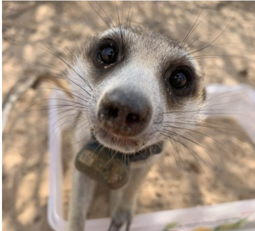
The Worm's Heart (VCRM010) is now considered fully habituated and is often first to climb onto scales to be weighed.

Prior to this month The Worm's Heart had never been followed by observers for data collection. But he has allowed research assistants to undertake regular three-hour sessions just as they would for fully habituated groups. We are all very impressed with his progress. Time will tell if Fake-e-plan and Lazuli 3 will remain together and become proper, established groups in the future. We will keep you updated on the life history of both sub-groups.