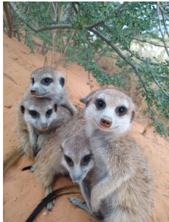
The youngest litter at Jaxx, including subordinate juvenile female Lord Kinbote (VJXF051) and subordinate juvenile male The Doctor (VJXM054) who were chased away by Jaxx after their encounter with a group of wild unmarked meerkats.

The next morning another observer waited for Jaxx to get up from the sleeping burrow to get their morning weights. Before the meerkats emerged, she found the unknown juvenile. It was still lying where it was last seen and had died during the night, either from the cold or internal injuries. As Jaxx woke up, the observer only counted 18 meerkats, which meant the three exiled members had not been able to rejoin yet. While the group started sunning, the observer could see three meerkat heads pop up in the distance as Salamander, Lord Kinbote and The Doctor tried to make their way to the rest of their group. This resulted in Jaxx starting a war dance to chase them away. The observer witnessed this type of behaviour three more times before she returned to the farmhouse at the end of her session and left Jaxx to figure out what to do about their new group composition. When another observer tracked the group the next morning, he found all 21 members coming up to sun together.