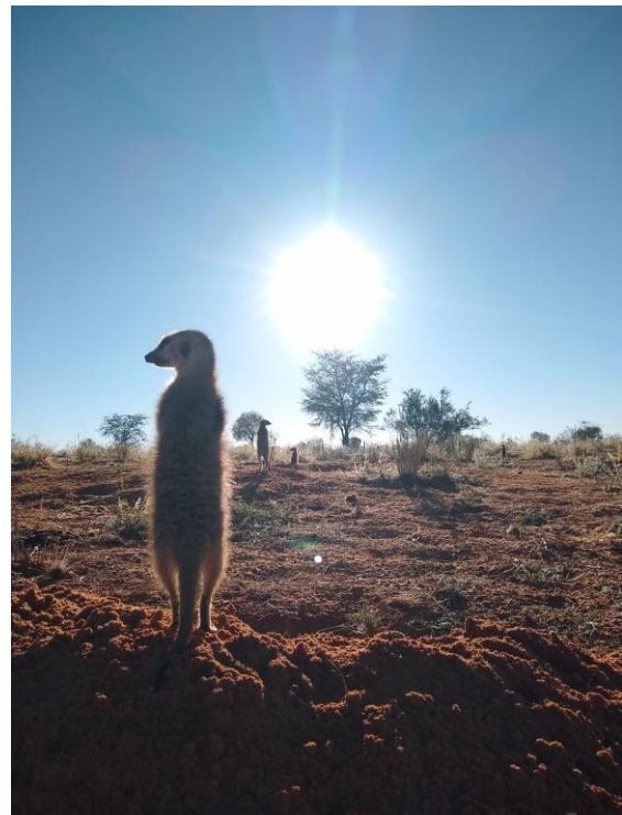
Elrond's Council sunning before they start their daily foraging.

comfortable with being followed while the group is foraging. Subordinate adult female Pippin (VECF003) is not too happy either with observers visiting her group regularly, but she loves egg and it is possible to weigh her. Since Tae Bae's disappearance, we believe one of these two females will become the new dominant female at Elrond's Council. So far, however, neither has received enough direct submissions from other females in the group. We agree on a new dominant when at least half of the adults of the same sex have given them direct submissions. Hopefully, we will know more by the time the next Meerkatter comes out.