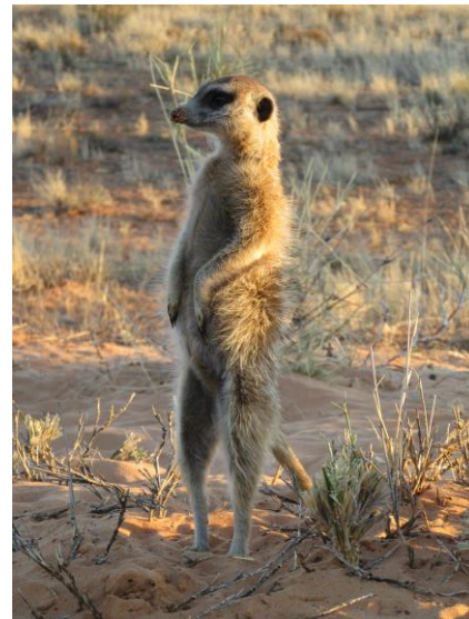
Side Quest's pregnant dominant female Pumba (VZUF048).

Males can go roving for anything from a single afternoon to several months at a time. During these forays males try to find reproductive opportunities, mainly with subordinate females from other groups. Even though breeding can occur year-round, it primarily takes place from September to March. Of course, we cannot be entirely sure of this, but we have a feeling the unexpected rain has set a few things in motion at the KMP.