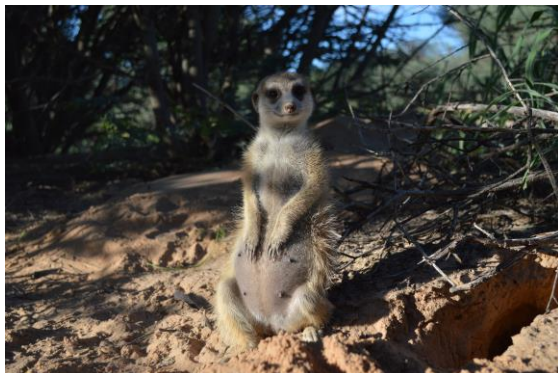
Former dominant female Skirmish (VNQF009) pregnant with her last litter.

As already mentioned in the last Meerkatter, tuberculosis was on the rise again at Namaqua. In recent weeks, two individuals have succumbed to their symptoms. Yearling subordinate female Chandler (VNQF017) disappeared from the group between the 22 nd and 25 th of June and is assumed dead. Dominant female Skirmish (VNQF009) was found dead a few days later.