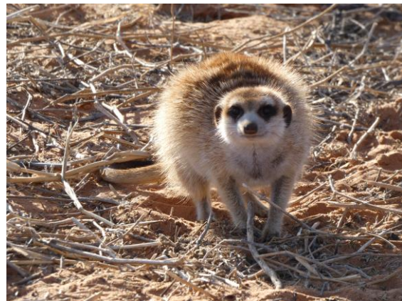
Elrond's Council's dominant female Galadriel (VECF032) looking highly pregnant.

The ladies that require work at Elrond's Council are dominant female Galadriel (VECF032) and adult subordinate female Pippin (VECF003). Galadriel has gone from a skittish meerkat to one that is all over the scales during morning weights and loves egg and water. She will occasionally bark at observers who are following her and the distance at which she tolerates us depends on the day. She has recently given birth and does have a history of becoming more nervous around people and very protective of her pups. It remains to be seen how her new litter will affect her behaviour. Pippin needs a bit more convincing, but we have also been able to weigh her consistently. Her two weeklong evictions from the group in July do not seem to have impacted her habituation.