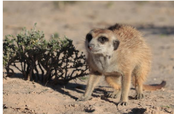
Lazuli's dominant male Odin (VLM266) is no longer considered a habituation meerkat.

At Lazuli, the two main targets are the dominant male Odin (VLM266) and adult subordinate male Captain Barbosa (VLM265). Both have improved massively over the course of the past few months, to the extent that Odin is no longer considered a habituation meerkat. He has become quite eager around the scales and has become increasingly more comfortable with being followed while foraging. Captain Barbosa evolved from being occasionally weighable, to an egg and water lover who comes into the scales most sessions. He waits until everyone else has jumped in and things have quieted down but is happy to come close to us and the scales after that. It is however quite the challenge to dye him. As long as we do not make too much noise or move too quickly, he is fine with us following him in the field at about 2m.