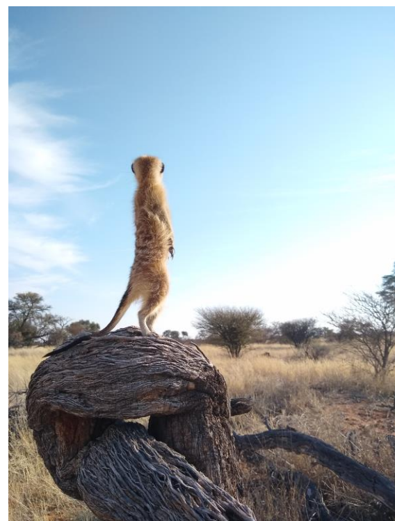
Thorn (VMPM027) on guard for Make-e-Plan.

This interaction was different though. The two groups spent more than an hour at a distance of about 70m from each other. Each group found a dead tree to use as their IGI basecamp and constantly had at least one meerkat on guard to keep an eye on their rivals. From a safe distance the two groups would regularly war dance a few meters and then retreat again. It never turned into a full-on confrontation or chase.