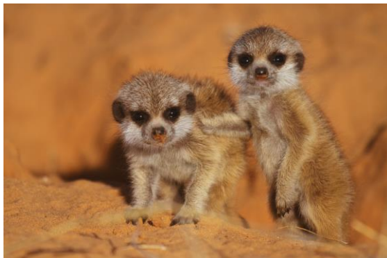
VSIF005 and VSIM006, the new pups at Side Quest.

Side Quest's dominant female Pumba (VZUF048) gave birth on the 1 st or 2 nd of July. A first pup (VSIF005) was seen on the 20 th and two days later observers spotted a second one (VSIM006). The tiny meerkats received dye marks so that they could be identified at a distance to ensure accurate data collection. They first emerged respectively on the 21 st and 23 rd , which is when they made their way past the lip of the burrow of their own accord. The litter had their first burrow move on the 28 th and started foraging with the group the next day. Pumba was the only female who lactated for this litter, but her sister, adult subordinate female Timon (VZUF049) did most of the babysitting at the group. Unfortunately, the little male has not been seen since the 4 th of August and we assume he was predated. The other meerkat is doing well and has become a proud new member of our smallest group on the reserve.