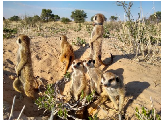
Six of the ten meerkats that remain at Trackie-Daks at the end of November.

Sub-adult female Savakes (VTDF006) and littermate Ketje (VTDM007) have also been given their Last Seen after not being sighted for a month. Savakes was last seen with the group on the 30 th of September and Ketje has not had any sightings after the 15 th of October. Observers were quite disappointed by their disappearance as we were finally able to weigh Savakes after months of habituation work focused on getting her comfortable around the scales.