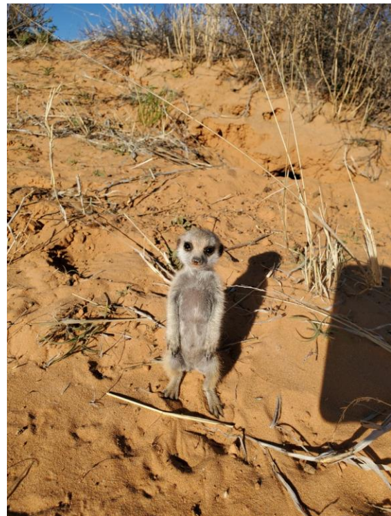
VECF042, the only pup from adult subordinate female Pippin's (VECF003) litter that survived.

At the end of October, adult subordinate female Pippin (VECF003) gave birth, so we were all very much looking forward to welcoming new pups in November. The litter of four (VECP042, VECF043, VECF044 and VECF045) first emerged on the 12 th , started foraging with the rest of the group on the 16 th and had their first burrow move on the 17 th . While an observer was there on the 18 th , she saw VECF045 looking very weak and die shortly after. VECF044 was not looking well during that same session but was still alive when the observer left and was also seen the day after. That was, however, its last sighting and we assume it was predated. VECF043 has not been seen since the 21 st and will be given a Last Seen if it does not reappear within 10 days. The first pup to be marked turned out to be the strongest one. VECF042 is the last one standing and seems to be doing really well.