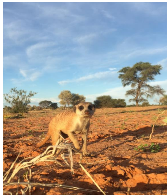
Pippin (VECF003), the dominant female at Elrond's Council 2, who joined the group after leaving Elrond's Council.

Normally, we would make the sub-group an official group as soon as they have been together for two months or breed successfully. As observers believe both Arabella and Vivienne might be pregnant, that day might not be too far off anymore.