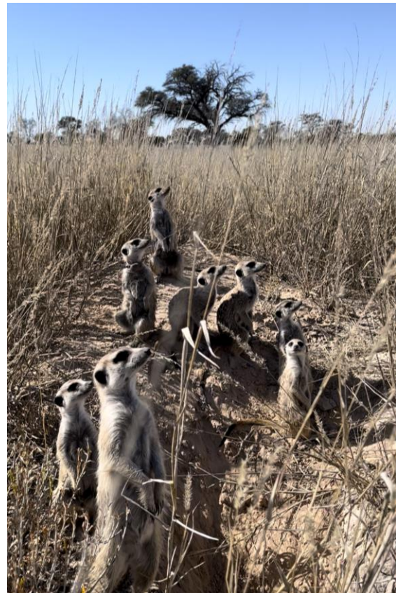
Brussels Sprouts alarming at a Martial Eagle from a bolt hole.

dominance competition behaviours and neither has submitted to the other.