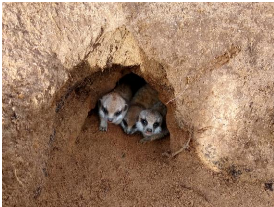
The first pups to emerge at Ubuntu.

The last time we wrote about Ubuntu in detail at the end of January, two pups had just emerged. As the dominant female Daisy (VBBF111) and adult subordinate females Magali (VUBF023), Mameuf (VUBF026) and Cthulhu (VUBF035) all gave birth over the course of nineteen days, we knew there were probably still more pups in the sleeping burrow. We were anxiously waiting to see how many more would emerge. Ubuntu surpassed everyone's expectations when the group broke last summer's pup record. No less than thirteen pups had emerged by the 8th of February.