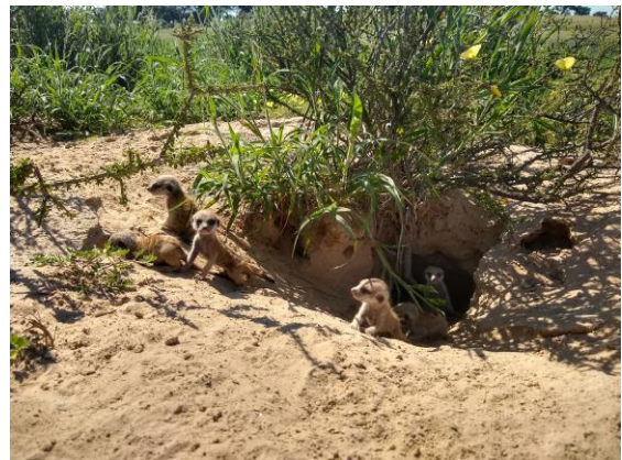
Six of the youngest Ubuntu pups when they first emerged.

Their pups had barely emerged, and the adults already had their work cut out for them. The total group number increased from eleven to twenty-four, which meant there were now more pups than adults, making pup feeding a particularly challenging job. The five oldest pups, born to Daisy and Mameuf, are all still alive. They all started foraging on the 4th of February, almost two weeks before the eight smaller pups started on the 17th. It was clear that those five were much bigger, stronger, and more confident and were often observed stealing pup feeds from their younger siblings or even attacking them. Out of the eight smaller pups, five survived to this day. VUBP057 disappeared on the 31st of March, VUBM054 was last seen with the group on the 2nd of April and VUBP056 on the 17th. All three were given their Last Seen ten days after they disappeared.