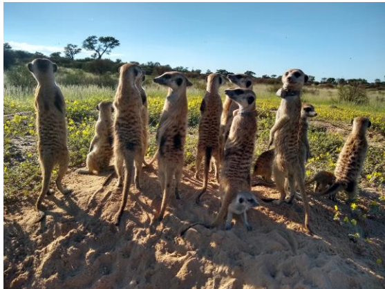
Elrond's Council in January, before the group became unstable.

the group and keep track of potential female dominance changes. Although we do not have DNA evidence to support this yet, Mojo Jojo and Snoop Kat were born while Palestrina was already the dominant male at the group and are quite likely his offspring. We believe Palestrina might be looking for another group where he can challenge the current dominant male or at least to try his luck as a roving male. Only time will tell what the future has in store for Elrond's Council.