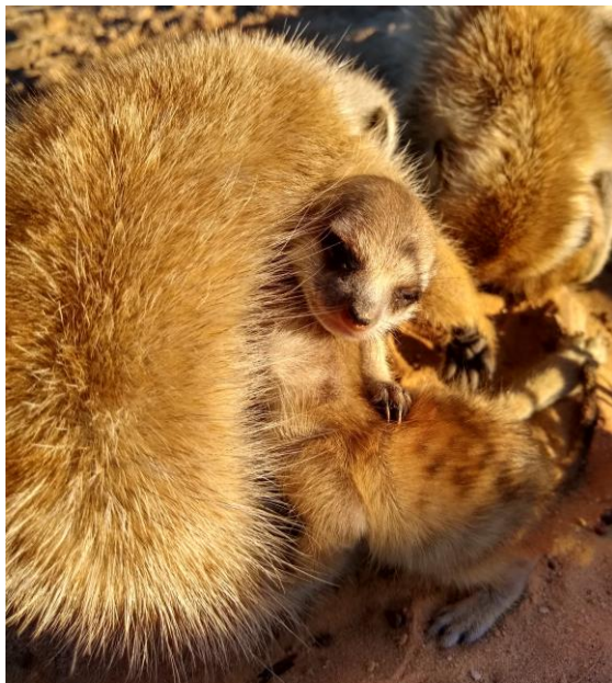
The former dominant female Calypso (VECF027) taking care of the youngest litter at Elrond's Council.

The disappearance and likely death of the dominant female Calypso (VECF027) at the start of April 2022 marked the start of a period of instability at Elrond's Council. At the end of March, she aborted at least three pups. After that her health quickly declined; she became very skinny, was lethargic and seemed to have a uterine prolapse. We last saw her on the 2 nd of April and presume she died shortly after.