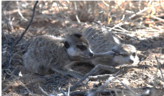
Adult female Tuna Fish II (VGDF026) batting away dominant male Odin (VLM266) after they mated.

Odin finally found another group where he could become dominant! He immediately started asserting dominance on Moteck, and Moteck submitted to him. Fleabag (the suspected but unconfirmed dominant of Dik-Diks) however, did not want to be near him and chattered at him whenever he approached. The reason why we suspect Odin stayed at this group, was because after the death of previous Lazuli dominant female Sigma (VLF230), her daughter, dominant female Dumpling (VLF272), took over. She is potentially Odin's daughter and to avoid inbreeding, he must leave the group. However, in some evil twist of fate, the group Dik-Diks (with a very smug Odin) encountered Lazuli again at around 12:30. He, along with Moteck, possibly got confused as to which side they were on, met up with Lazuli and while Dik-Diks was running away from the much larger group, Odin and Moteck stayed with Lazuli.