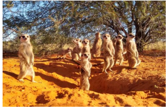
The group Trackie-Daks sunning in the morning sun.

This group has been a habituation group for the last three years. There have been great observers who have dedicated a lot of time to get the individuals habituated to hands, eating egg, and being weighed in the scale. Their patience has paid off and the group consists of very politely eggy individuals (except Fly who will bite your fingers if they have egg on them and she has a strong bite, so observers beware!).