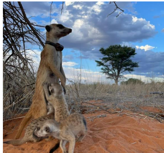
Dominant female Tolkien (VECF019) with her pups, Tiramisu (VALM007), Cleopatra (VALF008) and Felix Jaeger (VALM009).

for Kilie. At the time of writing, Kilie has not returned to the group, and there are no signs that Tolkien is pregnant. Hopefully, if Tolkien does become pregnant and given birth, she will allow Kilie back into the group to contribute to raising the pups.