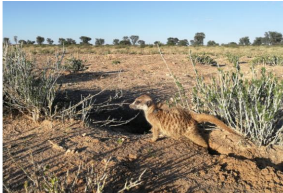
Baymax anal marking a shrub near Zulus sleeping burrow.

The year 2023 has been a golden year for many Gold Diggers rovers. Many found a new group to join, and their arrival drastically changed groups' dominance dynamics. While a dominant female is generally natal to the group, male dominants are typically unrelated immigrants joining groups either singly or as part of a coalition (Clutton-Brock & Manser, 2016). They may actively displace an incumbent dominant or following the death or disappearance of the previous male they may assume dominance. This has been the case for some of the most renowned Gold Diggers rovers.