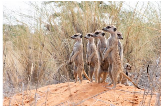
Whiskers in May 2023.

As we reflect on the past year of 2023 many of the meerkat groups have experienced great change. This change has come in the form of dominance shifts, new pups, new immigrants, and loss of individuals and all these changes have come to pass at the beloved Whiskers group.