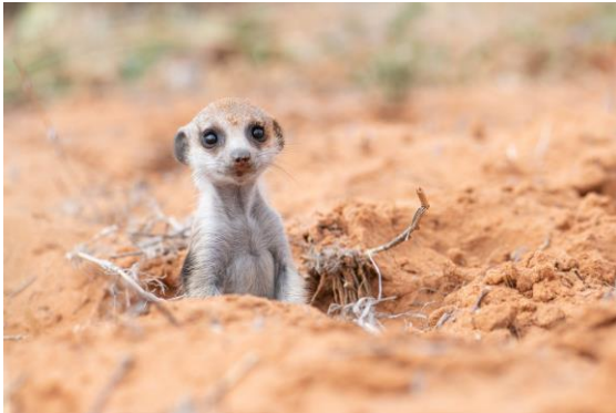
Curious little pup Mya photographed in May 2023.

Throughout the winter period between April and October there is less breeding activity, however on the 8 th of August 2023 observers noticed Luna's growing belly and she was made officially pregnant on the 18 th of August. During the time that she was pregnant Luna evicted four adult subordinate females: Laika, adult subordinate female Emily Bronte (VWF243), Virginia Woolf and adult subordinate female Chomp (VWF251) on the 11 th of August. Luna gave birth between the 9 th and 11 th of September, and after a long line of five previous litters which were lost before emergence this was a chance for Luna to have her first successful litter.