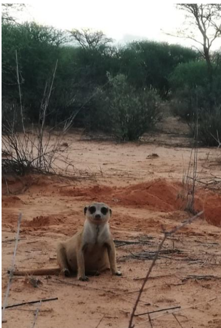
Pippin (VECF003), subordinate female in Elrond's Council, resting while heavily pregnant.

There are several theories as to how dominant females usually maintain their higher conception rate and have a much higher reproductive success. It is thought that subordinate females often have reduced access to unrelated males within their group and so incest avoidance appears to occur. Within a group, many of the females are likely to be the offspring of the dominant male, with any other subordinate males also being their siblings. Therefore, subordinate females will usually only breed when there are either unrelated males immigrated into the group, or when they are able to interact with roving males.