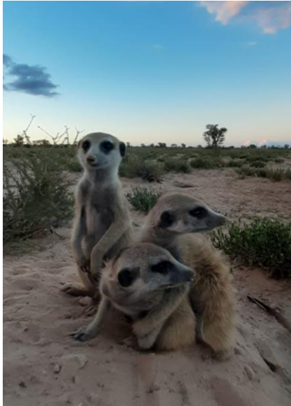
Members of Lazuli showing some vigilance while resting at their burrow one evening following the end of the dispersal.

In the following days, sightings were recorded for both Lazuli and this new potential subgroup (“Lazuli 2”). In this period, Lazuli were no longer babysitting and there were no lactations occurring. In comparison at Lazuli 2, Lennon had begun to lactate with babysitters being left. The subgroup had seemed to settle, and were regularly seen foraging together, with some dominance competitions seen between the two females.