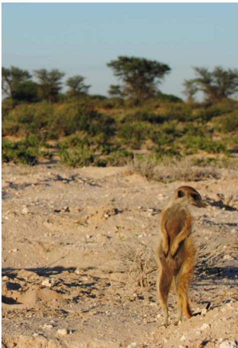
Timon (VZUF049), subordinate female in Zulus, sunning at the burrow while pregnant.

In comparison, three subordinate females – Lil G (VZUF029), Lentil (VZUF032) and Timon (VZUF029) – becoming pregnant successfully is not quite as surprising for Zulus. Spruddel (VZUF028) has been dominant in the group since May 2019, and while she has had two successful pregnancies, both litters were sadly lost before emergence. In this time, there has only been one other successful pregnancy and litter; Lentil had a litter consisting of Timon and Pumba (VZUF048) shortly after Spruddel lost her litter in May 2019. These recent pregnancies are positive news for the group as they are the first since the previous litter. The recent immigration of the three Whiskers males – Scuzi (VWM213), Pixie (VWM210) and Jay-a-rod (VWM216) – and new dominance change is likely to be a contributing factor. While the outcome of the pregnancies is unknown, babysitters and lactations appear to show success, and there have been four pups seen below in the sleeping burrow at the end of this month. It will be difficult to determine whether the pups may be from Lil G or Lentil's litter due to their birth being only approximately a week apart. As for Timon giving birth at the very end of this month and at only 10 months of age, the fate of her potential pups will also be interesting to follow for how subordinates may succeed or fail in their endeavors to reproduce.