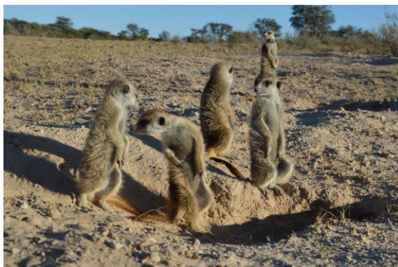
Little Creatures sunning at their sleeping burrow. L-R: Dazai (VCRM011), Hange (VCRF012), Mildred (VCRF009), Trash (VCRM008), and The Worm's Heart (VCRM010) at the back.

at 10m, but the remaining male still required a much larger distance of 15-20m. Our volunteers persisted and by March all three were much better within just 3m and were showing interest in egg and water! Wallace (VLM264) was successfully dyed at the end of March, with Captain Barbosa (VLM265) and Odin (VLM266) dyed in mid-April. Observers are now trying to push them a little further with trying to follow them for a short period of time after they leave the sleeping burrow, with current progress ranging from 10-30m. With the rest of the group maintaining their great habituation levels, it is hoped that progress will continue to be made in short time so that Ad Lib data collection can be resumed soon. We will continue to be keeping an eye on which of the males may be the new dominant of the group.