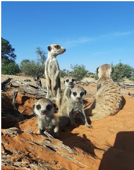
Members of Tswana, including three of the young pups, showing interest in the camera.

Tswana is our most recently started habituation group being first captured in April 2019 – just 1 year ago! In such a short time, they have made some massive improvements with the hard work of our volunteers, and we are very excited to announce that all individuals at the group are now dyed. This is excellent news as this means we can now fully identify each individual and record data for the entire group.