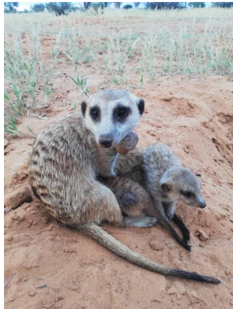
Spruddel (VZUF028) suckling pups from litters VZU2002/2003 and VZU2004.

This unusual situation will be one that we follow closely, as to whether these events may have an impact on any dominance changes and movements within the group as well as how the success of the females may continue or change. We hope that the pups will continue to succeed and allow Zulus to maintain their larger group size.