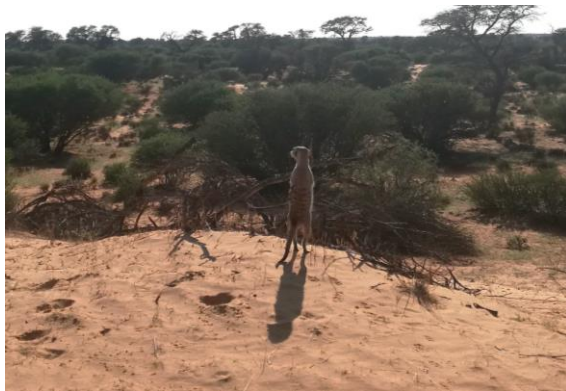
Sauce (VZUM026) guarding Elrond's Council territory.

Studies looking into the roving activities of males often find that most activity is experienced between June and December which reflects higher female fertility levels and more instances of evicted females. They also report that subordinate males that reside with their natal group are more likely to have greater roving activity than immigrant males of a similar age, due to the availability of unrelated breeding partners.