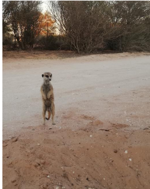
Sauce (VZUM026) seen roving at Namaqua.

Council was very brief, and he had returned to Zulus just the following day. For the following 6 months, Sauce continued to regularly leave Zulus for short time periods, with no clear indication of where he was going as he was not seen interacting with any other groups. There was just a single occurrence following an inter-group interaction between Zulus and Elrond's Council where Sauce left following this, and so it was assumed that it may have once more been Elrond's Council that was his destination.