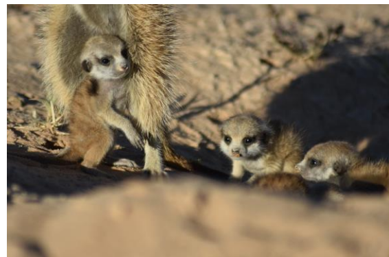
Three of the young Make-e-Plan pups shortly after their first emerge during May.

Meanwhile at Jaxx and Lazuli we are awaiting to see if pups will emerge. There has been consistent babysitting at both groups, with dominant female Baloo (VJXF080) and subordinate female Nāvis (VJXF128) lactating at Jaxx. At Lazuli dominant female Sigma (VLF230) and subordinate female Annie (VLF240), who gave birth within two days of each other, have both been lactating. It will be interesting to see how the Winter Babies fare in the months to come.