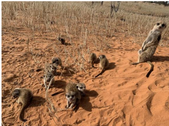
Boromir (VECM016) babysitting all nine fully emerged pups at Elrond's Council.

The majority of meerkat pups are born in the peak breeding season (September to March), and yet across the past two months we have had at least seven females give birth to litters where pups have survived to emergence or where groups were still showing babysitting and lactation activity by the end of the month. These births have occurred in six out of twelve of the study groups including Elrond's Council, Make-E-Plan, Namaqua, Ubuntu, Jaxx and Lazuli. Female meerkats are able to reproduce up to four times per year, with dominant females usually attempting to breed 2-3 times annually and subordinate females rarely attempting to breed more than once a year.