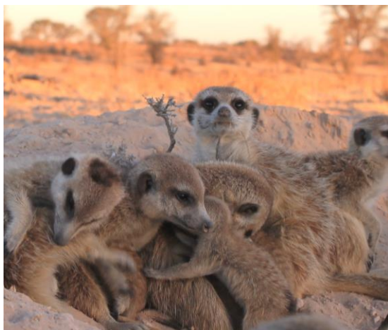
Lazuli huddling together at their burrow on the flats, facing the camera is the newly confirmed dominant male Odin (VLM266).

These group movements reflect what previous studies have speculated. During the dry season groups typically prefer to occupy flat habitats. These areas may offer more bolt holes (small burrows used as refuges from predators) than surrounding habitats such as dunes, potentially presenting a lower risk of predation. The cost to this is may be less productive foraging. In the wet season meerkats are more willing to take risks by foraging in the highly productive dunes where the abundance of prey, at that time of the year, may outweigh the risk of potentially increased predation.