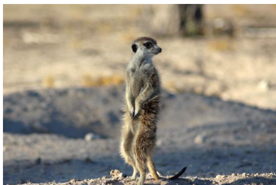
Newly immigrated male Shrew (VUBM018) being vigilant at Gold Diggers.

At the time of Shrew's immigration into Gold Diggers there were four males remaining in the group, this included the yearling male George (VGDM006), the sub-adults Jack (VGDM010) and James Sawyer (VGDM011), and an undyed yearling male. On the morning that Shrew emerged with Gold Diggers he was seen anal-marking the group's sleeping burrow and other individuals, advertising his presence. Observers have not yet witnessed any submissions or dominance competitions from the other males, the boys have mostly been ignoring each other, therefore the position of dominant male remains unclear.