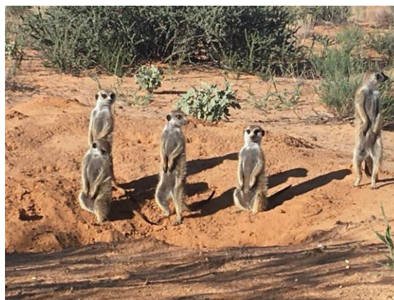
Members of Gold Diggers sunning one morning, taken back in the wet season long before Shrew's (VUBM018) immigration.

Previous research undertaken at the Kalahari Meerkat Project has shown that typically the oldest and heaviest meerkats are most likely to become dominant in a group. The day after Shrew immigrated into Gold Diggers the undyed yearling male did not emerge with the group. He has not been seen since, it is assumed he voluntarily left the group or was predated. This means the only remaining competition Shrew has for the position of becoming the dominant male is George, Jack and James Sawyer, who are all younger, smaller and possibly closely related to the females. Shrew is the only adult male in Gold Diggers and is potentially the heaviest male present. Furthermore he is likely unrelated to any of the females.