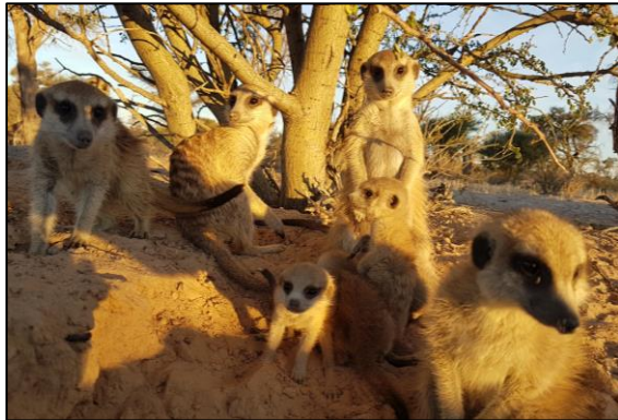
Some members of Make-e-plan at sunset. The pups are dominant female Bridget's (VQLF011) litter born in April.

commonly than other dominant females. She has also demonstrated impressive intelligence (she learnt after just a single false drongo alarm to ignore them for the rest of the morning). Bridget's group occupies a large territory, parts of which cover areas with flora not seen at other groups such as flats where (in the wet months) one can find themselves surrounded by a field of beautiful pink lilies. At any one time an observer following Make-e-plan may have Cape ground squirrels, pied babbler, hornbills, red-breasted shrikes, glossy starlings and other smaller species of birds within metres of each other simultaneously!