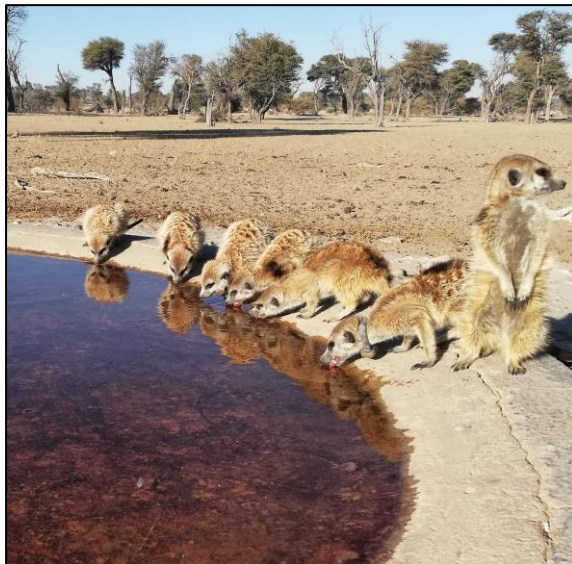
Make-e-plan stopping for a drink at a dam. The radio collared individual is dominant male Banksia (VVHM117).

It was 4 years ago that Quintessentials females Bridget (VQLF011) and Heatherleigh (VQLF018) were discovered with Zulus male Pi (VZUM006), acting as part of a new group later called Make-e-plan. This month we are going to take a look at the history and current composition of this group to see why they have become popular among the current research assistants.