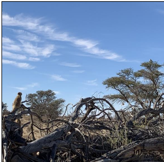
Lazuli subordinate female Weasel (VLF241) closely monitoring the Pale-chanting Goshawk in a distant tree after the incident.

Among the few different symbiotic relationships meerkats share with neighbouring species, one of the most interesting is the relationship with the intelligent black-coloured bird, the Fork-tailed Drongo. Occasionally when meerkats dig up insects (which are often inaccessible to the birds) some prey escape and are snatched up by the awaiting drongos. Other times meerkats consume part of a meal, leaving small morsels behind that the drongos will feed on. The meerkats benefit from having the drongos around through their early-warning system; if a drongos sees a predator such as a large bird of prey, something which threatens both drongos and meerkats, the drongos will emit an alarm that the meerkats will respond to. One morning at Lazuli, this relationship took a step further and most likely spared a pup from the talons of a predator – an observation that we have possibly never heard about before at the Kalahari Meerkat Project.