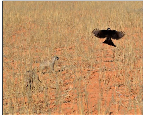
A drongo taking off with a cricket it had stolen from a Zulus juvenile.

Annie (VLF240), and a single drongo. In a matter of seconds both meerkats and drongo emitted high urgency alarm calls and the group scattered. A Pale-chanting Goshawk had dived in seemingly out of nowhere and was swooping down towards a fleeing pup. At the same moment the drongo deliberately flew at the goshawk, screeching and flapping its wings erratically. In response the goshawk rapidly turn-tailed and flew away to a nearby tree. Lazuli re-grouped and closely monitored the goshawk for the rest of the morning, keeping the tiny pups close. The goshawk made no further attempts to snatch a meerkat.