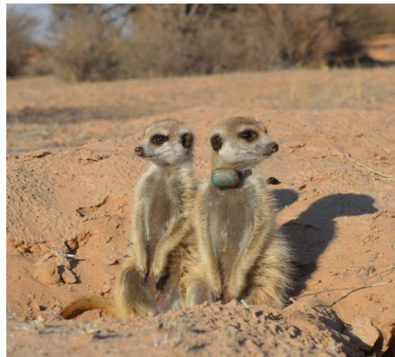
Little Creatures males Dazai (VCRM011) and The Worm's Heart (VCRM010) were very tolerant of observers during a capture.

Progress has also been made with the reserve's oldest meerkat group, Lazuli, who have been around since 1995. Of the wild males that immigrated into the group in December 2019, it was Odin (VLM266) who became dominant two months ago. He and subordinate wild male Wallace (VLM264) have become very comfortable in the presence of observers, both regularly climb into the scales for weights and allow the research assistants to follow them within 5 meters. The third wild male, Captain Barbosa (VLM265), is a bit less tolerant but is still sufficiently habituated for behavioral data collection. This month Lazuli have returned to being followed and studied for full Ad Lib sessions, the same as the fully habituated groups. The speed at which observers have recovered Lazuli almost completely to their former habitation level is certainly remarkable. This progress also means the individual characteristics of the wild males have become more easily recognisable. Odin in particular has a tendency to sneak up on unsuspecting observers during weights and give a nip to vulnerable fingers. Hopefully he doesn't become quite as bite-y as Lazuli's previous infamous dominant male, Polon (VJXM095).