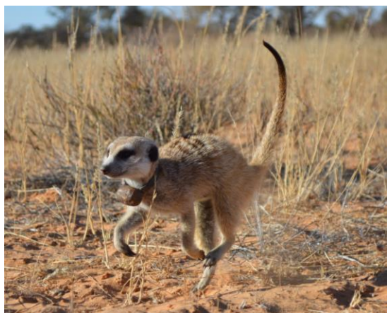
Dominant female Spruddel (VZUF028) leading Zulus out to forage.

Unfortunately for her, two other females in the group were also pregnant. This included her littermate Lil G (VZUF029) who Spruddel was directly competing with for dominance, and another being a younger related female, Lentil (VZUF032), who was not participating in the dominance competitions. With three pregnant females present the inevitable occurred; Spruddel and Lil G gave birth within 1 day of each other and then lost their litters to infanticide by the remaining pregnant female Lentil. She was observed mauling and killing six pups. It is not known who the mother of each pup was.