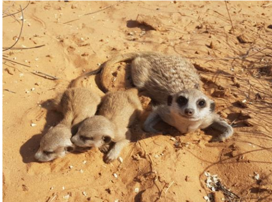
From left to right: the unnamed Zulus pup (VZUP060), Tsotsi (VZUM061) and Zuma (VZUM059) lying in the sand.

emerged pups will usually spend an extra week staying at the safety of the burrow in the company of babysitters. Being so young, Spruddel's litter struggled to keep up with the other individuals. But the group, particularly subordinate female Timon, were attentive to the pups and no major dramas occurred. The litter were babysat at the burrow over the next three days before once again being taken out to forage. On the 17 th one of the pups, VZUP060, disappeared and was assumed predated as it was never seen again. The other pup, Tsotsi (VZUM061), has been thriving off all the attention and was a healthy 222g at the end of the month.