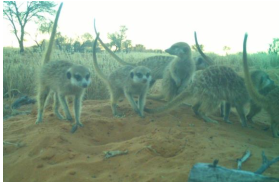
A photograph captured via camera trap of a wild group located at Pharside Dam. There has been at least 19 individuals counted in this group.

adult male still have some way to go in terms of habituation, but the rest of the group's members have proven to be among the most tolerant meerkats of all of the habituation groups.