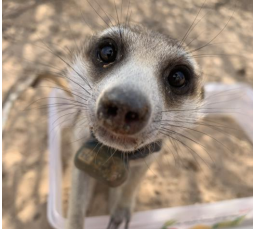
The Worm's Heart (VCRM010) is now considered fully habituated and is often first to climb onto scales to be weighed.

Prior to this month The Worm's Heart had never been followed by observers for data collection. But he has allowed research assistants to undertake regular three-hour sessions just as they would for fully habituated groups. We are all very impressed with his progress. Time will tell if Fake-e-plan and Lazuli 3 will remain together and become proper, established groups in the future. We will keep you updated on the life history of both sub-groups.