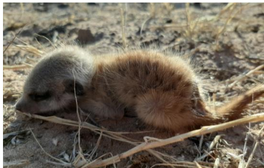
The unnamed kidnapped Aristokats pup VAKP001.

Last month we saw the founding of a new sub-group, Aristokats, formerly called Lazuli 3. The group originally consisted of Little Creature's male The Worm's Heart (VCRM010) and Lazuli females Annie (VLF240), Weasel (VLF241) and Squelch (VLF250). On the very first day of November they had an extra member: a tiny, unmarked pup. None of the females had shown any signs of pregnancy or lactation, so observers concluded that the pup must have come from a different group. Aristokats had been spending much of their time in Jaxx territory not far from the burrow where the Jaxx dominant female Baloo (VJXF080) had given birth in. The Aristokats pup was estimated to be around 2 weeks old based on its size, coat condition and barely opened eyes. It was around the same age as the Jaxx litter that had not yet emerged or been marked. Observers therefore speculated that Aristokats' newest member was truly a Jaxx pup that had been stolen from the burrow. However, without anyone present to witness what had happened no one knows for certain where the pup came from.