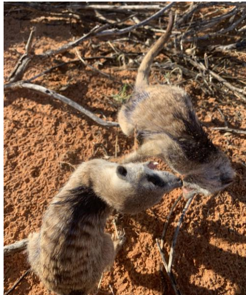
Shiraz (VJXM122) and Merlot (VJXM121) competing for dominance at Fake-e-plan.

female Spruddel (VZUF028). Unfortunately for Legolas, Spruddel repeatedly turned down his advances through chattering and face-swatting. Not to be deterred, Legolas interacted with some of the younger males of the group including Godric (VZUM053) and initiated dominance competitions. However once Scuzi noticed the intruder, Legolas was sent running for the dunes.