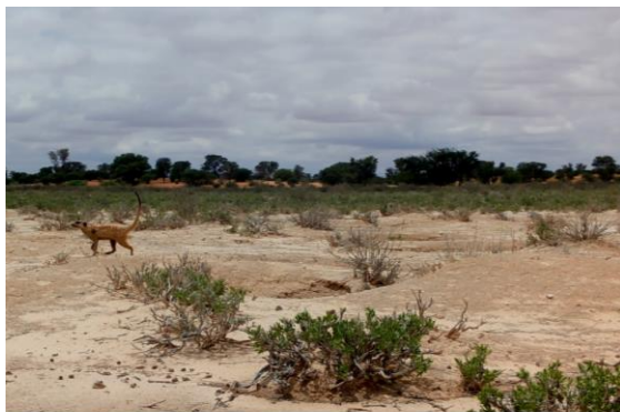
11-22-2020 11:27:21 Yearling male Legolas (VECM009) was captured via camera trap footage roving on the border of Zulus and Ubuntu territory.

Coinciding with the large number of births and pregnancies is a similarly large number of males voluntarily leaving their groups to go roving. Continuing from last month: Namaqua's former dominant male Lewie (VLM228) has been seen visiting Zulus, Make-e-plan and Ubuntu. Other roving males from October have been on the move again this month, including Shandy (VHMM023) and Wallace (VLM264) from Lazuli and Jay-A-Rod (VWM216) from Zulus.