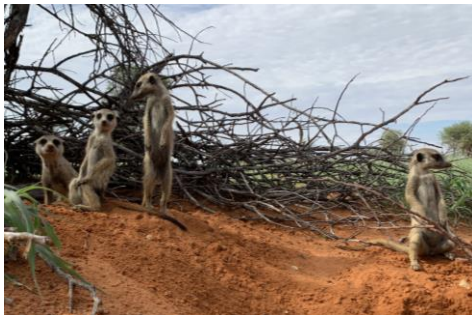
Individuals from Tswana2, from left to right: adult male Coquille (VTSM014), and juveniles Moon Moon (VTSM022), Marvin Gaye (VTSM021) and Fergalicious (VTSM020).

In comparison, Fergalicious is just over 3 months old, therefore observers are highly doubtful that she will show signs of dominance anytime soon. Without a clear matriarch and with so many mature males present, there are concerns that Tswana2 will disband. Major group movements following the loss of a dominant female are common. A group cannot maintain their numbers without a breeding female and are doomed to eventually phase out. The only hope for males is to seek out unrelated females elsewhere. Furthermore, Fergalicious is too young and light to wear a radio collar. This means only males who are likely to go roving and be absent from Tswana2 are eligible for collaring. The current collared individual is yearling male Jiminy Cricket (VTSM007). It likely will not be long until he starts prospecting for females.