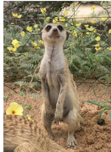
Yearling female Skirmish (VNQF009), the new dominant female of Namaqua.

To everyone's surprise, Zuko emerged with Namaqua nearly a week later. He has been reported to have a slight limp on his left hindleg and small wounds to his left forearm. Zuko has been foraging with the group and seems likely to make a full recovery. Perhaps Skirmish and the rest of Namaqua will learn from their encounter with Make-e-plan and choose their future skirmishes more carefully.