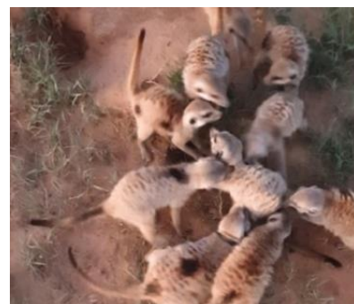
Zulus back up their dominant male Scuzi (VWM213) in the attack on subordinate male Jay-A-Rod (VWM216).

In January 2020 Pixie emerged one morning with a deep, bloody wound to his throat. Observers assumed Scuzi was the one who inflicted the injury as he had previously been particularly aggressive towards Pixie. The wound left a large permanent scar which made Pixie easily distinguishable from other meerkats. A month later Scuzi was confirmed dominant and Pixie became regularly subjected to further aggressive dominance assertions. On two occasions he was even witnessed being attacked and evicted from the group.