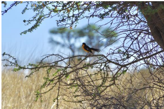
The elusive yellow morph of a Crimson Breasted Shrike has been spotted by several observers in Elrond's Council's territory.

had quite a few injuries, that he got either while he was chased off from Elrond's Council or from Zulus' dominant male Scuzi (VLM213) when he tried to rejoin his natal group after his little trip. Finally, two more meerkats were given their last seen after not being seen for a month. Subordinate yearling male Bliksem (VECM024) was last seen on April 13th and subordinate yearling female Arya (VECF026) went missing on the same day as Tae Bae was last seen. Observers are currently extra keen to visit Elrond's Council. The rare yellow morph of a Crimson Breasted Shrike has been spotted in their territory a few times and all the birders are hoping to catch a glimpse of this magnificent bird.