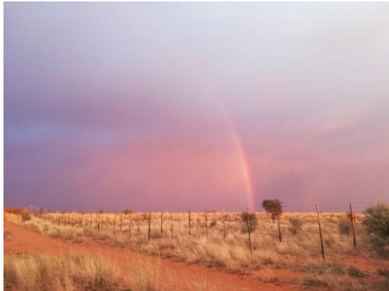
Even rainy skies look amazing in the Kalahari.

for the juveniles to show us their pup feeding skills as they will assist the adults in rearing the pups.