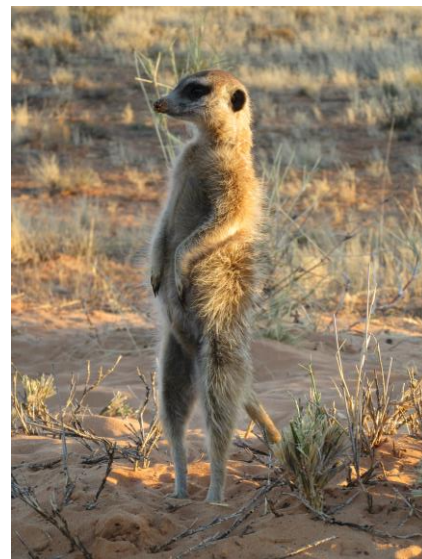
Side Quest's pregnant dominant female Pumba (VZUF048).

Males can go roving for anything from a single afternoon to several months at a time. During these forays males try to find reproductive opportunities, mainly with subordinate females from other groups. Even though breeding can occur year-round, it primarily takes place from September to March. Of course, we cannot be entirely sure of this, but we have a feeling the unexpected rain has set a few things in motion at the KMP.