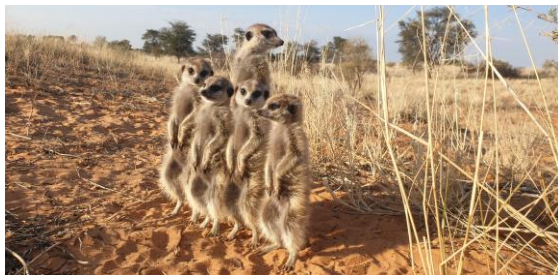
The newly discovered group Side Quest.

On the 26th of May a master's student was heading to Zulus to do playback experiments. On her way there, she came across three friendly adult meerkats who seemed used to the presence of humans. The meerkats had four juveniles with them who were clearly a lot less comfortable. The master's student radioed the farmhouse, and a meerkat manager came out with a transponder reader to determine whether these were known individuals. As we suspected from their behaviour, the meerkats had indeed been part of habituated groups before.