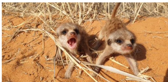
Two of the new pups at Phoenix.

On the 21 st , meerkat volunteer Tara Naeser witnessed a first pup emerge and heard a few more young ones that she was not able to see. There were no more sightings the next week, but on the 28 th it was again Tara who had the honour of meeting the litter of our most skittish group.