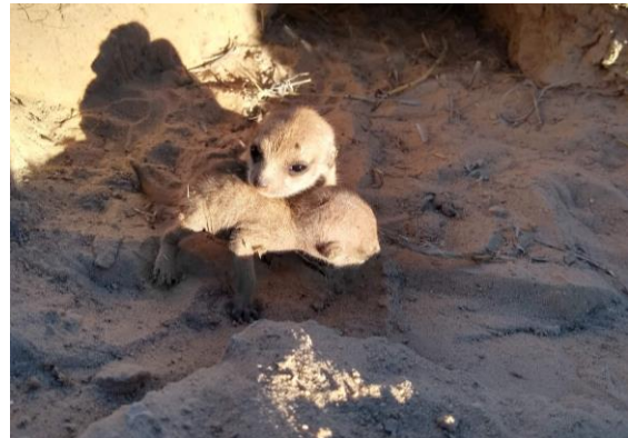
Tiny pups at Hakuna Matata.

Sencha (VHMF030), the dominant female at Hakuna Matata, gave birth on the 29 th of August. Two pups (VHMP055 and VHMP056) emerged on the 21 st of September. VHMP055 was last seen on the 23 rd and VHMP056 on the 26 th . As per usual, we will wait ten days for them to hopefully resurface, but this litter may have been lost. Especially as it was reported that VHMP055 did not look healthy. The pup had blood around its nose, was skinny and fatigued, and showed signs of laboured breathing. Moreover, observers also noticed Hakuna Matata shared their birth burrow with two monitor lizards, who definitely have meerkat pups as part of their diet.