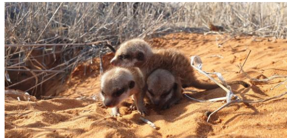
The new litter at Phoenix.

Phoenix had come up and were sunning, getting ready to start their day. Tara then heard little pup noises coming from the sleeping burrow. One by one, three little pups emerged while the adults started to make move calls. The group gradually left and two babysitters stayed behind. They were also making move calls and it seemed like they wanted to take the pups on their first forage. After a lot of coaxing, two pups followed them, but the third one needed to gain a little more confidence first. The two babysitters eventually decided to continue their foraging attempts with the rest of the group and left the pups by the sleeping burrow.