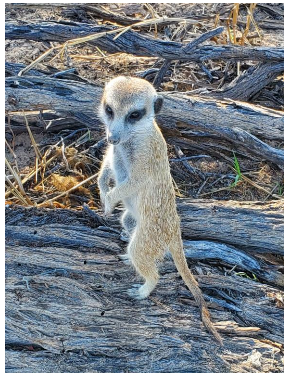
Slop (VLM253), an adult subordinate male from Lazuli, spotted by while roving.

It is therefore thought that males possibly also go on roving forays to find reproductive opportunities with females from other groups without having to actually disperse. The same research paper shows that subordinate males frequently go on forays outside of their normal territories for 1-150 days at a time. Females do not tend to leave their territories unless they are dispersing from their home group permanently. This same paper found that when subordinate males find a potential mate, they are often refused by the female and do not mate in close proximity to the rest of her group. It does however happen that those females temporarily leave their home groups with these prospecting males for up to 24 hours and mate out of sight. This phenomenon is not uncommon. It is believed that extra-group paternity, meaning that pups were sired by a male from outside the group, can be as high as 20-25% in meerkats.