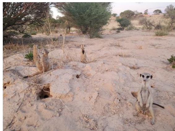
Make-e-Plan 4 by their sleeping burrow before they went below for the night.

The trio that left Make-e-Plan encountered Namaqua on the 22 nd . Namaqua saw the much smaller group; war danced at them and chased the meerkats away. The Make-e-Plan subgroup was then joined by adult male Zuko (VNQM012) and yearling males Barney (VNQM018) and Cooper (VNQM019) from Namaqua. The males chased Sidney away, who in turn joined Namaqua. The composition of this new subgroup has been stable since this day and is temporarily called Make-e-Plan 4 . If the group turns out to be breeding successfully or is still together in two months' time, we can consider them an official group at which time they will also get a new group name.