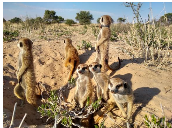
Six of the ten meerkats that remain at Trackie-Daks at the end of November.

Sub-adult female Savakes (VTDF006) and littermate Ketje (VTDM007) have also been given their Last Seen after not being sighted for a month. Savakes was last seen with the group on the 30 th of September and Ketje has not had any sightings after the 15 th of October. Observers were quite disappointed by their disappearance as we were finally able to weigh Savakes after months of habituation work focused on getting her comfortable around the scales.