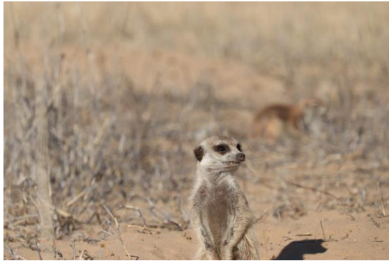
Sketchy Bongo (VTSM019) who has left Trackie-Daks and immigrated to Make-e-Plan this month.

Sushi has been displaying dominance behaviours at Make-e-Plan and could potentially take over dominance now that the previous dominant male Banksia (VVHM117) has gone missing. His chances are improved by the fact that Make-e-Plan's eldest males; adult subordinates Thorn (VMPM027), Maverick (VMPM034), Kanyonyi (VMPM036) and Doby (VMPM037) have all been away from the group for more than a month. We have, however, not witnessed enough direct submissions to him yet to be able to confirm this. Moreover, as Sketchy Bongo's habituation level is very low, it is quite difficult to determine if observer presence may be impacting what behaviours are being witnessed between him and Sushi or if we are missing displays of dominance behaviour from Sketchy Bongo.