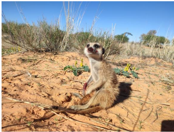
Yearling subordinate female Calypso (VECF027) still caring for a pup minutes after getting injured.

The session we found the dying pup was a very tumultuous one. At one point, yearling subordinate female Calypso (VECF027) went down a bolt hole and came back up with a bloody wound on her right wrist. We are not sure what happened, but she was not looking well at all by the end of the morning session. Over the next few days, she took it easy as she had a limp caused by the injury. To everyone's relief, she has made a complete recovery. She is a well-loved meerkat for being a good babysitter, often protecting pups if we come too close to them.