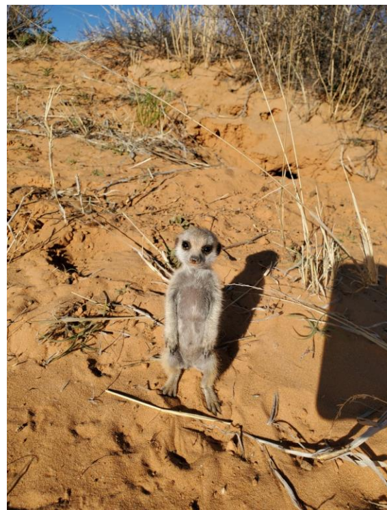
VECP042, the only pup from adult subordinate female Pippin's (VECF003) litter that survived.

At the end of October, adult subordinate female Pippin (VECF003) gave birth, so we were all very much looking forward to welcoming new pups in November. The litter of four (VECP042, VECP043, VECP044 and VECP045) first emerged on the 12 th , started foraging with the rest of the group on the 16 th and had their first burrow move on the 17 th . While an observer was there on the 18 th , she saw VECP045 looking very weak and die shortly after. VECP044 was not looking well during that same session but was still alive when the observer left and was also seen the day after. That was, however, its last sighting and we assume it was predated. VECP043 has not been seen since the 21 st and will be given a Last Seen if it does not reappear within 10 days. The first pup to be marked turned out to be the strongest one. VECP042 is the last one standing and seems to be doing really well.