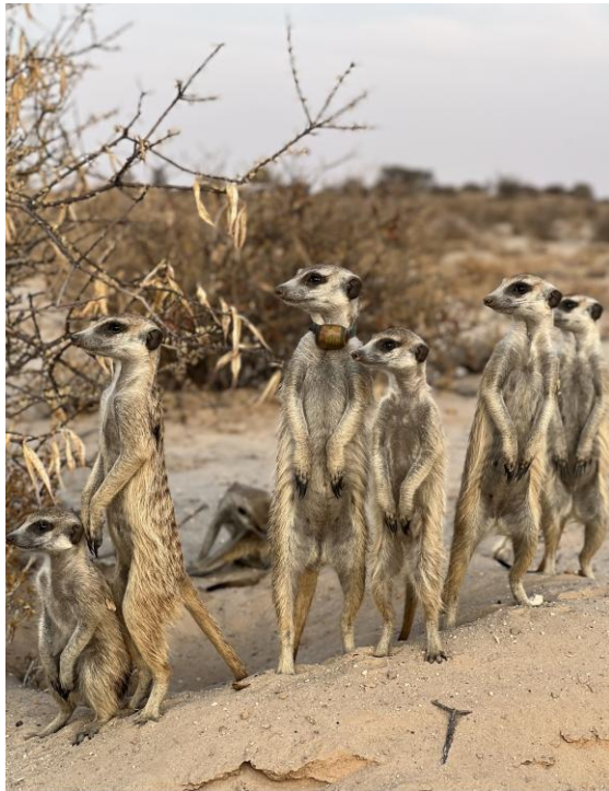
Trackie-Daks returning to their sleeping burrow in the evening, after a long day of foraging.

On the 15 th , observers heard her make lost calls while searching for the dominant male only to find herself alone and struggling to rejoin with the rest of the group. It is not the first time a dominant male has left the group in search of breeding opportunities, and we have previously witnessed collective leavings of roving males, eventually immigrating into different groups. A good example would be in January 2023 when previous Elrond's Council dominant male Palestrina (VLM211), adult subordinate male littermates Charlie (VECM031) and Pucky (VECM023), as well as adult subordinate male Ozzie (VECM033) immigrated into Alba and overthrew former dominant male Godric (VZUM053).