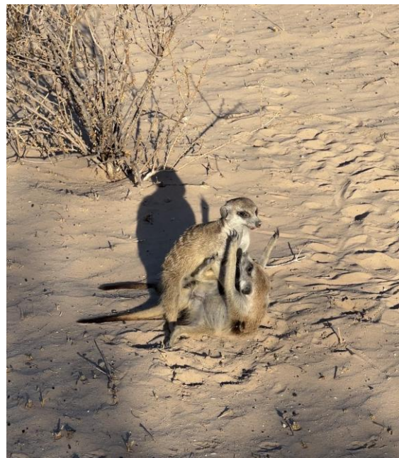
Ubuntu's dominant female Agazoth evicting yearling subordinate female Tiddlywink this month.

Ubuntu and Gold Diggers. On the 12 th of October, adult subordinate female Ricky Baker (VGDF031) was evicted during a morning session when the group war danced and chased her away while adult subordinate female Maya II (VGDF039) woke up at a different sleeping burrow entrance and did not act as part of the group on the 17 th . A few weeks later, an observer saw the eviction of yearling subordinate female Serafina Pekkala (VGDF049) wherein dominant female Goldeneye (VGDF007) attacked her and blocked her down a bolt hole before chasing her away from the group. Ricky Baker and Serafina have been seen since their evictions. Both females went down the same sleeping burrow after the group went down and were seen foraging at a distance from the group days after their last sighting with Gold Diggers.