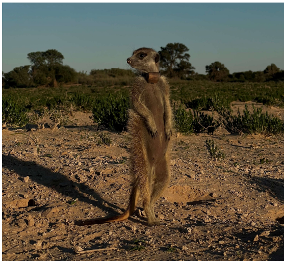
Masiwa (VLF308) sunning in the morning at the burrow.

balance between not being too threatening to the dominant female, but at the same time still being stronger and heavier than the 9 other subordinate females. Dominant females will evict those most likely to be reproductive competitors and considering age and size, older subordinate females are most likely to reproduce 1 . Subordinate females increase in size and weight as they age which makes older individuals, besides females that are more distantly related to the dominant, more likely to be evicted 1 . During her time as a subordinate, back in early 2023, Dumpling was evicted twice for an overall period of more than a month. The timing of her mother's death worked in her favour, as she was not evicted, and was able to assert her dominance straight away, avoiding a prolonged period of instability in the group. Dumpling gained dominance without observed contest from other females in the group and proceeded to gain 50 grams over the next month. This is a less drastic gain of weight than with Masiwa, still substantial and likely explained that Dumpling was already much heavier at this time.